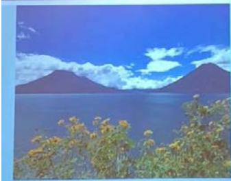
GUATEMALA TRIP NOVEMBER 2017